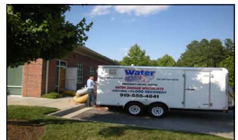
Water Out of Raleigh dries and saves local dentist office

"The greater the difficulty the more glory in surmounting it. Skillful pilots gain their reputation from storms and tempests."