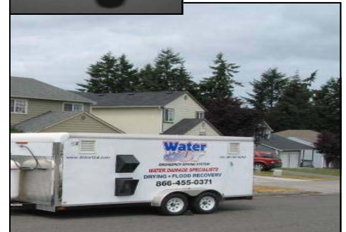
Water Out South Puget Sound in Olympia, WA dries local residence