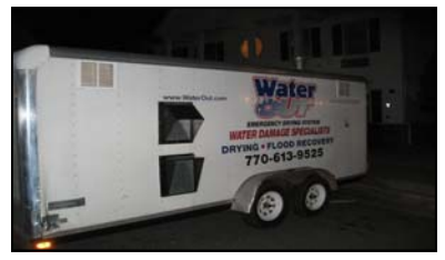
Photos above and below: Water Out Atlanta dries college dorm Georgia

Water Out Drying Corp 375 Faraday Ave, Jackson NJ 08527 Tel: (800) 848-1761 / Fax: (732) 942-6278 Email: info@waterout.com