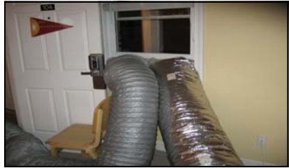
Photo below: Water Out in Libertyville, Illinois dries large home and saves hardwood floors